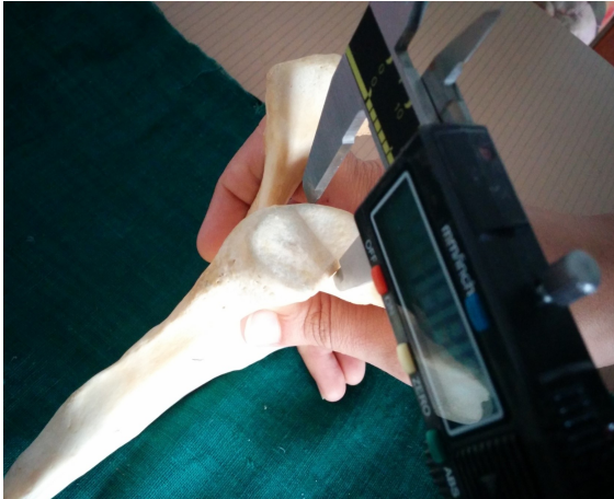
Fig. 4: Showing oval shaped glenoid cavity.