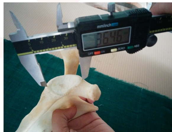
Fig. 2: Showing measurements of AP1 diameter of glenoid cavity of scapula.

Fig. 1: Showing measurements of SI diameter of glenoid cavity of scapula.