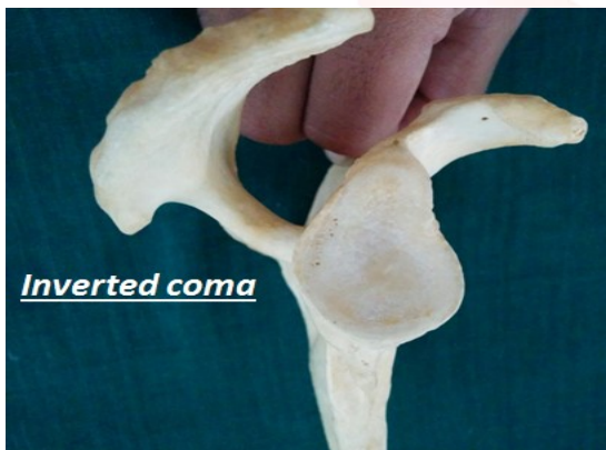
Fig. 6: Showing inverted comma shaped glenoid cavity