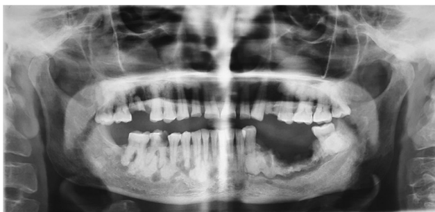
Fig. 2 Panoramic radiograph revealing generalized multiple homogeneous radio-opacities in the tooth-bearing regions of jaw with radiolucent rims, inferiorly displaced mandibular canal.

Panoramic radiograph revealed a diffuse irregular area of moth-eaten radiolucency interspersed with radio-opacity of the crest of the alveolar ridge in the left mandibular posterior region above the inferior alveolar canal and multiple homogeneous sclerotic masses with radiolucent rims in the tooth-bearing regions of the mandible and maxilla, bilaterally, above the inferior alveolar canal (► Fig. 2 ). The ramus, angle, and the body of mandible were spared. Full mouth intraoral periapical radiographs revealed hypercementosis with respect to 15, 17, 28, 44, 45, 47, lower anteriors and root clubbing in 12, 22 and maxillary left posterior teeth. Computed tomographic (CT) images of mandible and maxilla revealed multiple radio-opacities throughout the jaw. Axial