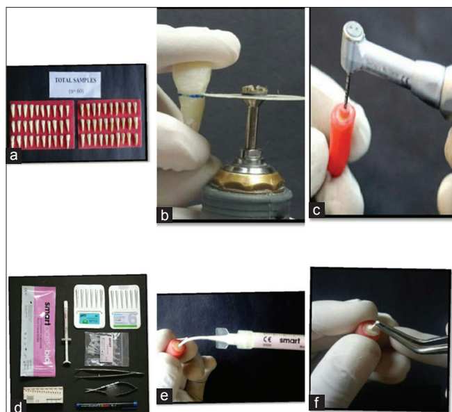
Figure 1: (a) Sixty extracted human permanent maxillary central incisors (b) decoronation using straight handpiece (c) canals prepared using K3 file system (d) armamentarium For C-point obturating system (e) the bio-ceramic resin-based sealer placed in canal (f) C-point is placed in the canal and plugged

be because sufficient heating of gutta-percha is essential in achieving a good adaptation to canal wall. According to Venturi and Breschi, multiple heating causes phase transformations in gutta-percha which led to change of crystalline phase gutta percha to amorphous phase. [15] Only with extremely slow cooling (0.5°C/h) of gutta-percha can the original phase be regained. However, with routine cooling, beta phase would be expected to reform which leads to shrinkage and increased leakage throughout the canal wall. [16-18]