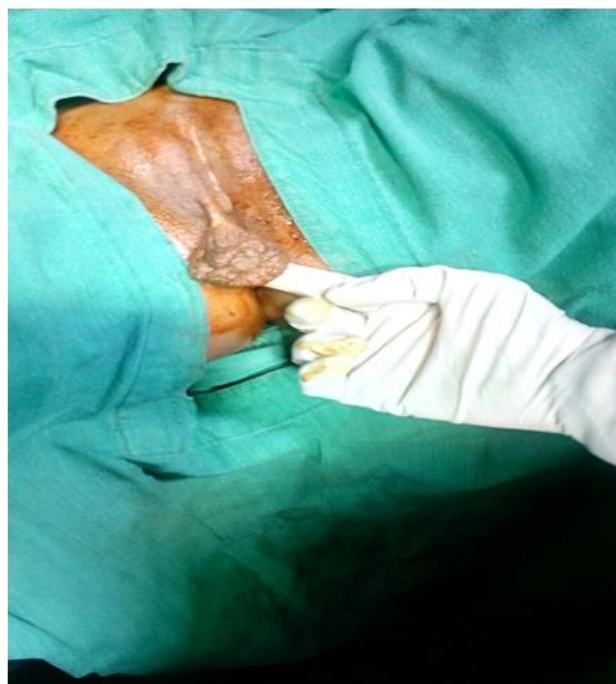
Figure 1: Haemangioma vulva.

A 23 year old female, nulligravida came with complaints of growth on medial region of the right vulva for 6 years, when she had first noticed it as a reddish subcutaneous nodule. She ignored it despite its gradual clinical enlargement. There was no significant past or family history.